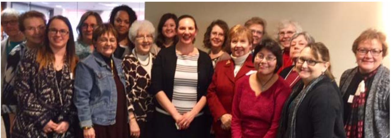
Legislative Day participants

AAUW-NE Legislative Updates along with a copy of our AAUW-NE 2017 Legislative Priorities are on the state website, aauw-ne.aauw.net , and were sent to your email address. Please take time to become familiar with our seventeen priorities. When an “Action Alert” is sent out from time to time during the legislative process, don’t hesitate to contact your senator to encourage them to support the AAUW Nebraska position on the item. By speaking with the same voice and by working together, we can make a positive difference in the lives of Nebraska’s women, girls, and families.