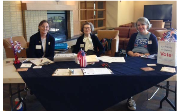
Voter registration with League of Women Voters